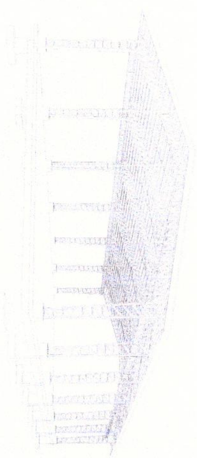
1 A EXTERIOR PERSPECTIVE