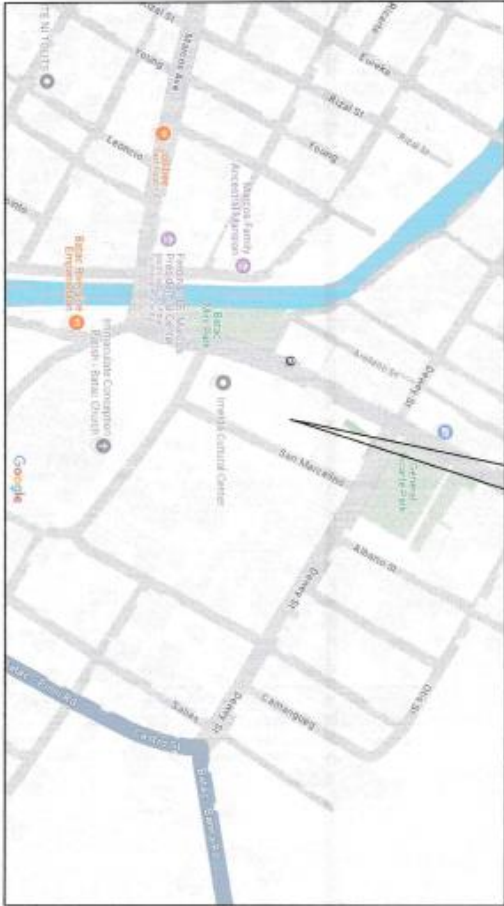
AR VICINITY MAP 003 SCALE NTS